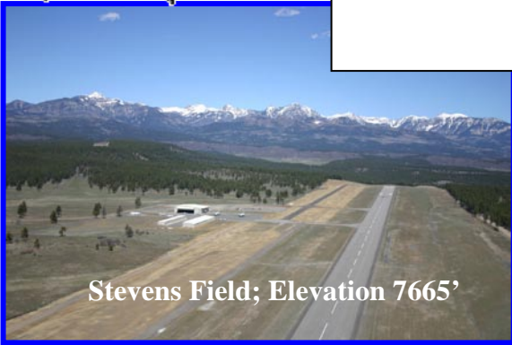
Stevens Field; Elevation 7665'